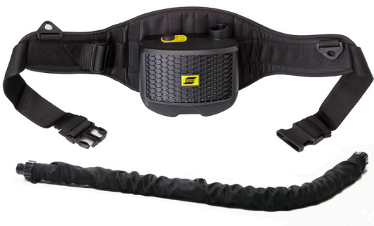
PAPR unit delivered with: Motor unit, Battery, Intelligent charger, P3 filter + Pre filter, Waist belt, Hose and proban hose cover