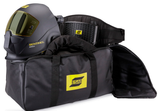
Kit bag available as a accessory item